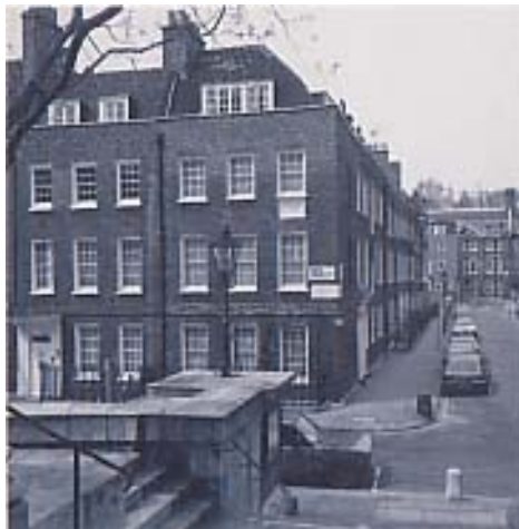
Smith Square Conservation Area, Lord North Street from Smith Square, SW1

Westminster's conservation areas are shown on the map below. If you are not sure whether your property lies within a conservation area you can see detailed maps at the City Council's One Stop Services (see the Westminster Contacts List link below). You can also enquire by telephone (020) 7641 2513 or Fax (020) 7641 2515 or write to Development Planning Services (see Contacts).