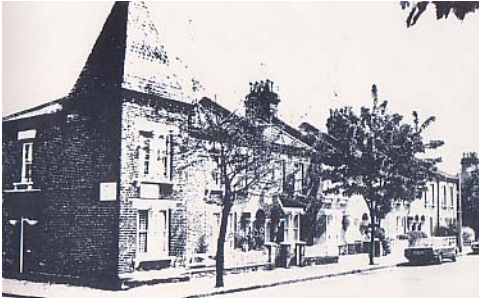
Queen's Park Estate Conservation Area, W10