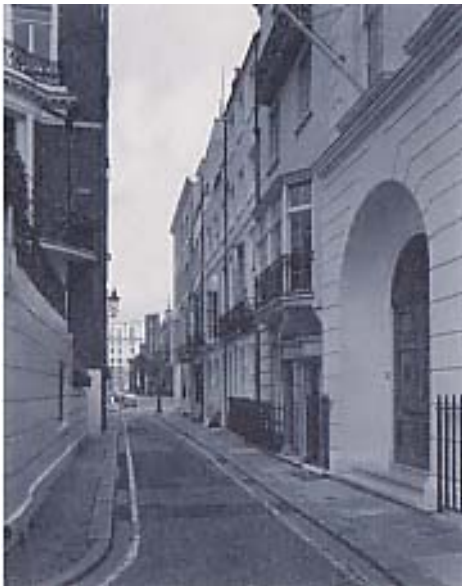
St. James's Conservation Area, Cleveland Row, SW1

The notes for applicants accompanying the City Council's planning application and conservation area consent forms state what information is required. In drawing up proposals for development you should take into account the fact that the City Council will expect a high standard of design, materials and detailing in order to preserve or enhance the character of the particular conservation area. Development proposals close to conservation areas will be also assessed in terms of their impact upon the adjacent conservation area.