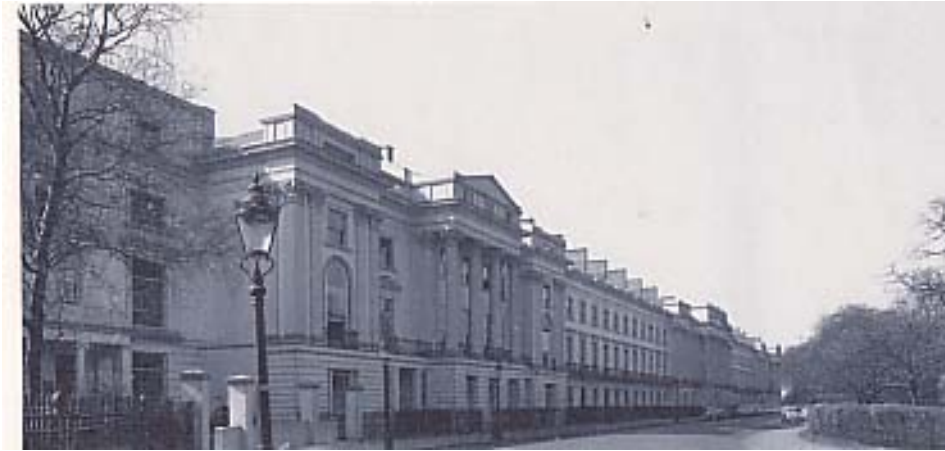
Regents Park Conservation Area, Cornwall Terrace, NW1

considered. Proposals affecting listed buildings should be discussed with officers from the City Council and from English Heritage (see addresses at the back of this leaflet). It is a criminal offence to demolish all or part of any listed building or structure without having first obtained listed building consent.