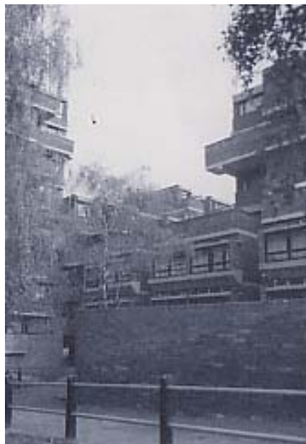
Lillington Gardens Estate Conservation Area, SW1

Copies of these applications are also sent to the local recognised Amenity Society for comment. Members of the Societies may be able to view those drawings, subject to the agreement of the Societies' officers.