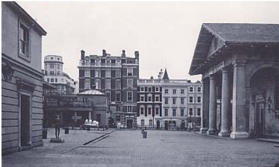
Covent Garden Conservation Area, Covent Garden Piazza, WC2 (photo, 1984)

One of the main implications of designating a conservation area is the additional powers granted to a local authority to protect buildings and trees in the area and to control works affecting them.