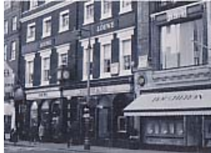
Mayfair Conservation Area, Old Bond Street, W1

Local authorities have additional powers in conservation areas over the type of advertisements that require advertisement consent. A separate guidance note is being published by the City Council on this subject and specific policies for advertisements are contained in the Unitary Development Plan. Advertisements should always be sympathetic to and in scale with the appearance of the conservation area.