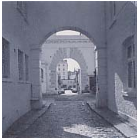
Belgravia Conservation Area, Eaton Mews North, SW1

In considering applications for conservation area consent the Council refers all applications to English Heritage for comments and seeks the views of major local Amenity Societies. The Council also invites comments from the general public by publicising these applications by means of site notices and by making the proposals available for inspection by interested members of the public.