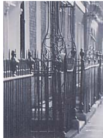
Mayfair Conservation Area, Chancery Street, W1