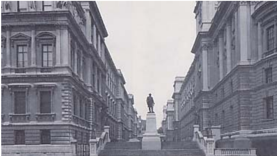
Whitehall Conservation Area, King Charles Street, SW1

All new development within conservation areas should be closely integrated into its surroundings. Within areas of uniform townscape new development should respect the proportions, form and characteristics of adjoining buildings. In some areas good modern design is often acceptable if disciplined by its townscape context, and is preferable to pastiche (the superficial use of architectural detail). The higher the quality of areas of unified townscape, the greater the discipline that should be placed on new development. In many groups of buildings where the architecture is strongly unified, replica facades may be the most appropriate design solution, if development can be accepted in principle.