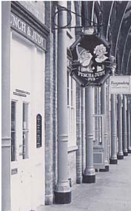
Covent Garden Conservation Area (former Market Building), WC2

Designated Conservation Areas in Westminster 2004