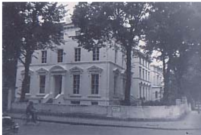
Maida Vale Conservation Area, Howley Place, W2

A large number of privately-owned trees in conservation areas already are protected by Tree Preservation Orders and records of these are kept at One Stop Services at City Hall, 313 Harrow Road and 91-93 Church Street, or can be checked by telephoning or writing to the Arboricultural Manager. Further information about trees is contained in two City Council leaflets: 'Trees: Legislation and Procedure' and 'Planting and Care' available from One Stop Services.